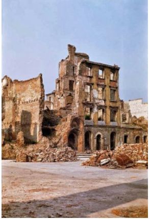
Post Office Savings Bank (PKO): pre-war and the remains after the war