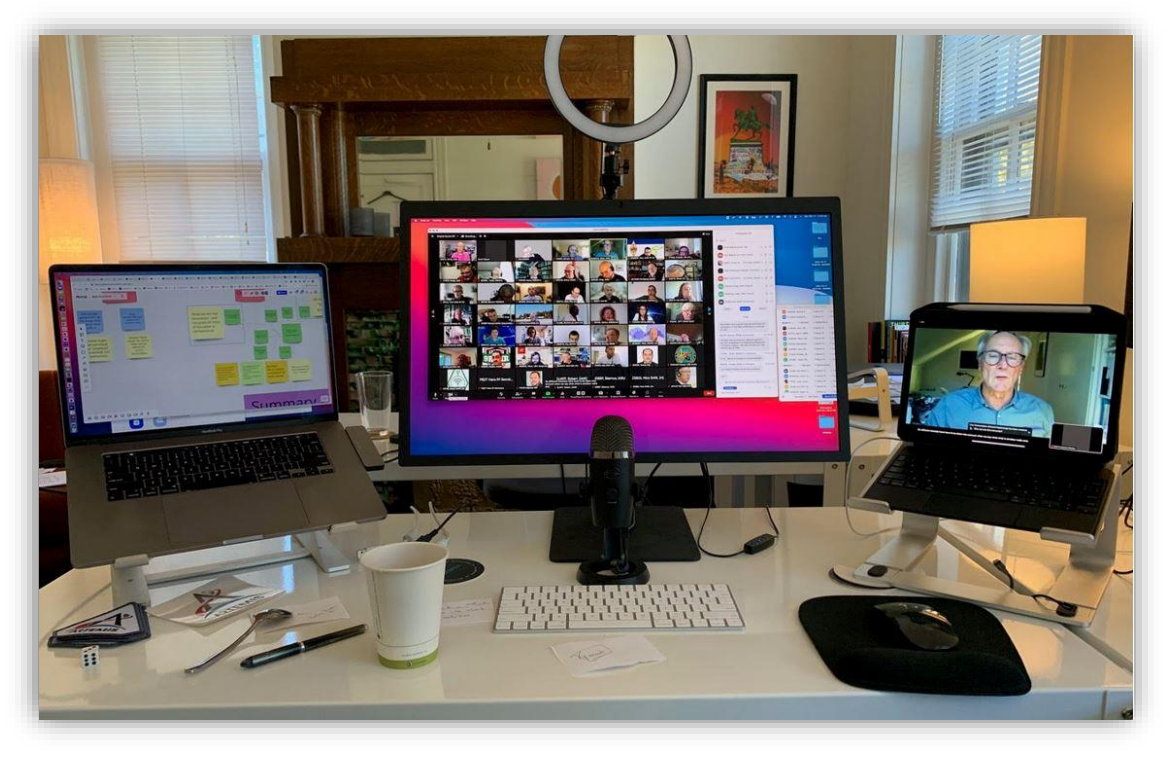
Figure 1A view of the Workshop - Miro board (post-its), Teams with all delegates, and presenter