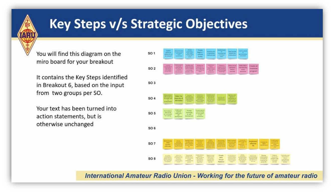
Figure 2 Delegates working in breakout sessions using a Miro board (post-it notes on right side) to refine Strategic Objectives. Break out session groups existed of +/- 10 delegates from different member societies.

We then discussed each of the above eight strategic objectives in turn and developed a first series of key steps<sup>1</sup> to get us to that 10-years point. This initial list will be continuously reviewed and updated by the Project Teams.